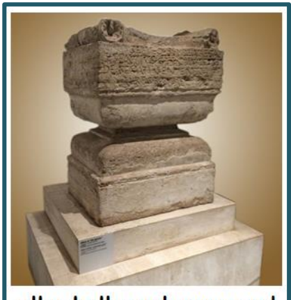
altar to the unknown god