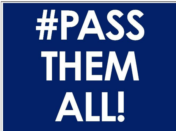
Side 2 of pastors' sign from rally

Women of all demographics and African American pastors and Civil rights