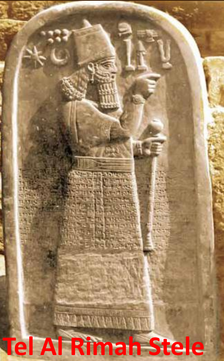
Tel Al Rimah Stele