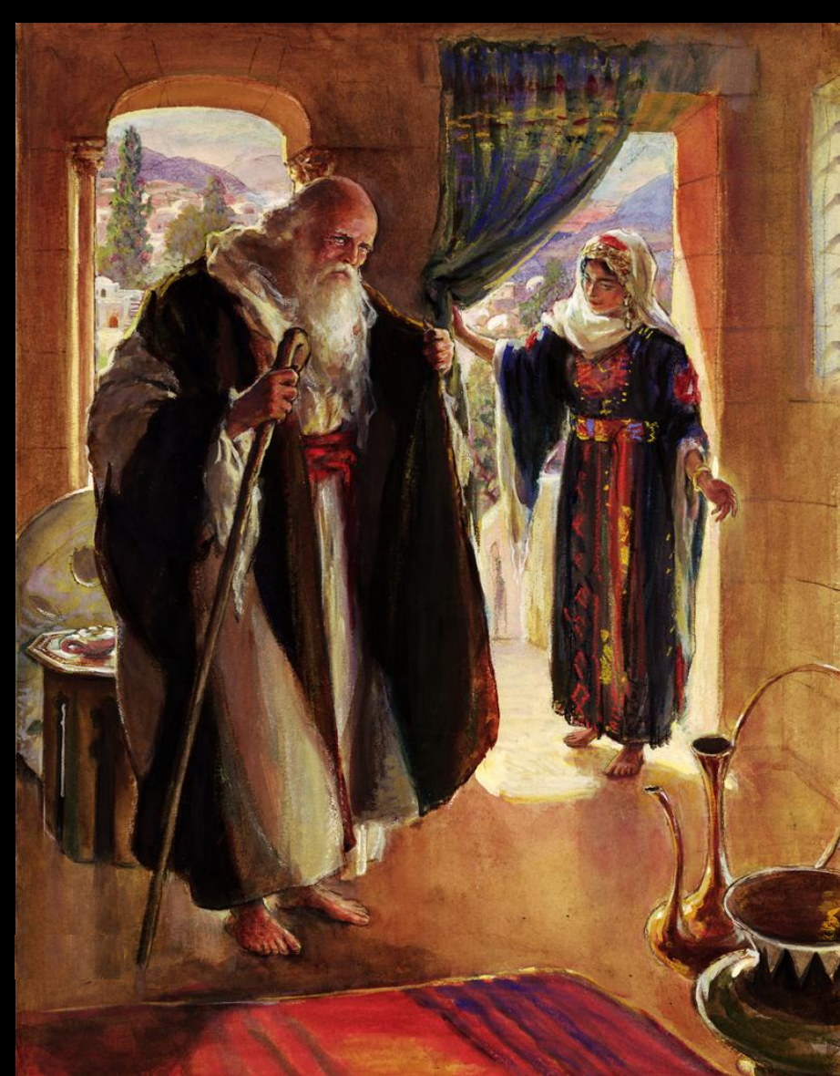
Elisha and the Shunammite 2 Kings 4:8-37